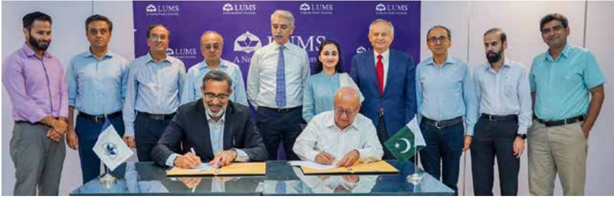
At an MoU signing, the Foundation committed to sponsoring financial aid scholars at LUMS