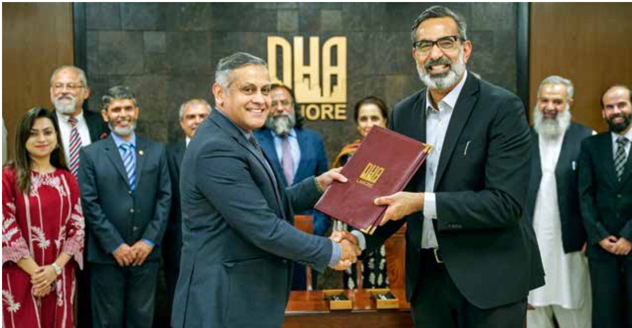
DHA, Lahore's generous donation will support NOP scholars at LUMS