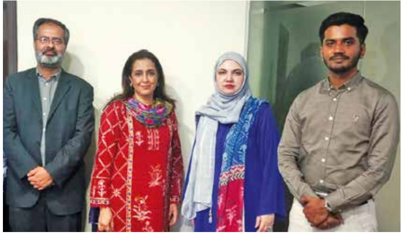
The discussion with Fast Cables focused on global and industry-specific challenges

Since 2016, Fast Cables Limited has been a dedicated supporter of LUMS' National Outreach Programme (NOP), significantly contributing to the educational advancement of deserving students. Their financial assistance has been vital in helping talented students from varied backgrounds pursue their academic aspirations and access higher education.