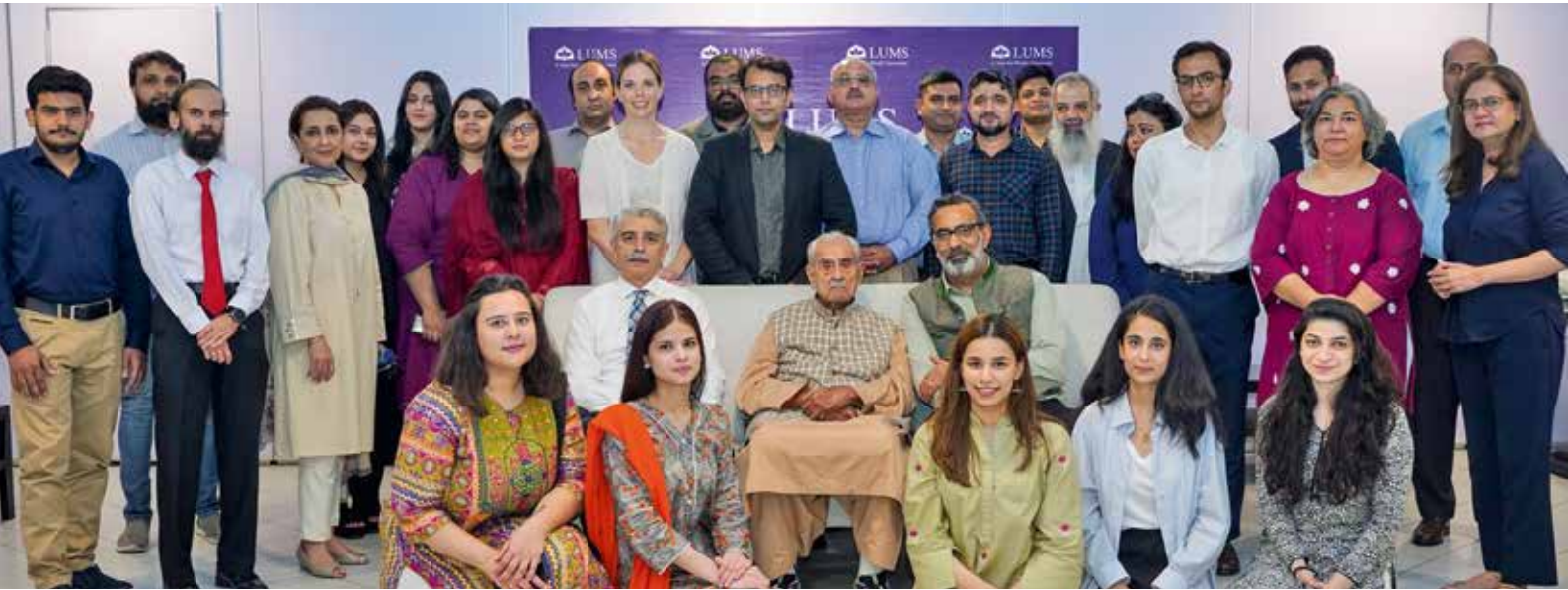
Syed Babar Ali with guests and the LUMS team at the launch of LUMSx

The Babar Ali Foundation has pledged to support LUMSx, the university's online learning platform. LUMSx is offering a rich set of diverse courses across various disciplines, making education accessible across socio-economic and geographic barriers. Through LUMSx, the University will broaden its reach to provide high-quality education.