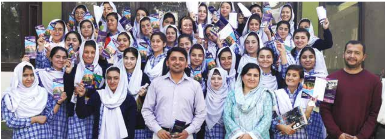
Students from Elysian School and College, Gilgit-Baltistan

Interestingly, lately, a consistent stream of NOP scholars has been coming from the same institutions because once an applicant gets admitted to LUMS through the NOP, they guide their juniors on how to apply and get selected. The scholars become a source of inspiration for their juniors who feel that pursuing higher education at a prestigious university such as LUMS is a possibility for them as well.