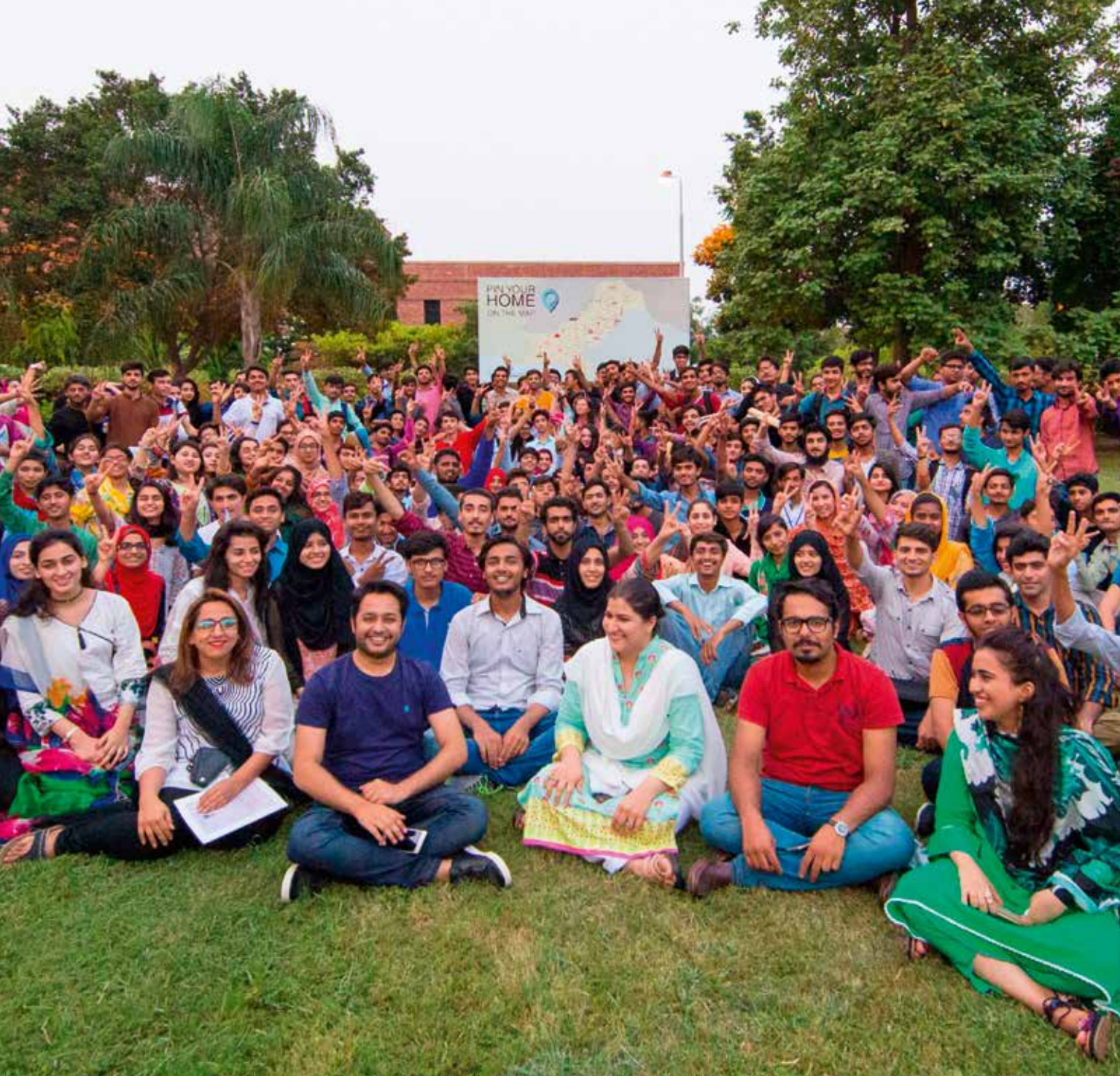
Summer Coaching Session participants with the NOP team