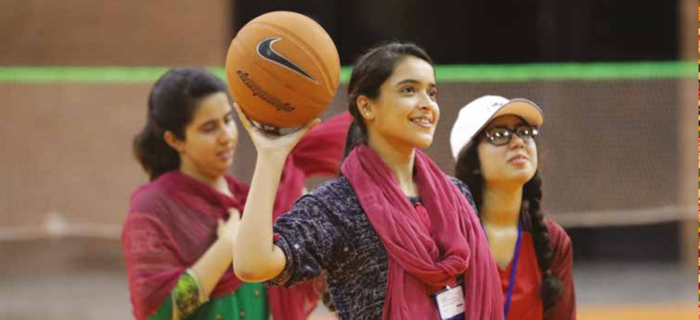
A basketball match in between classes