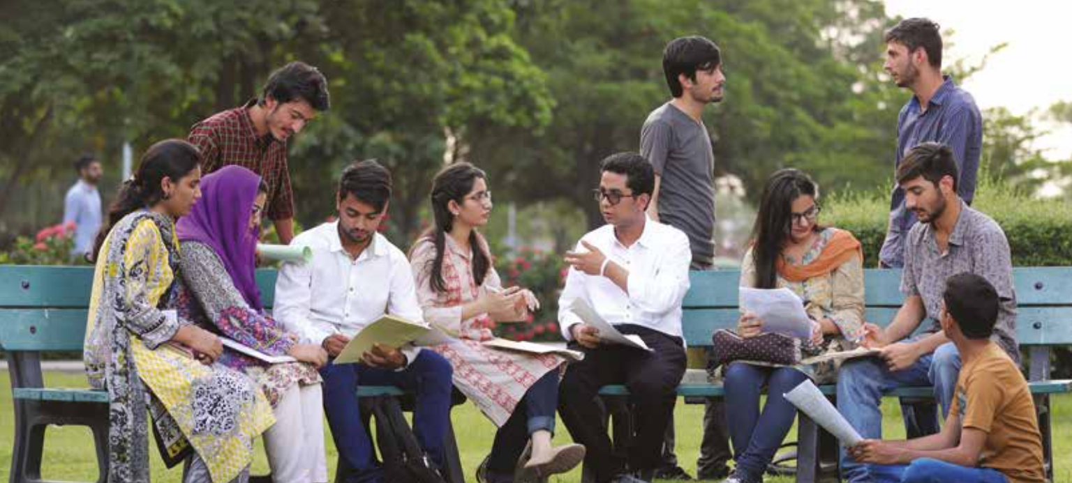
Scholars engage in a lively discussion after class