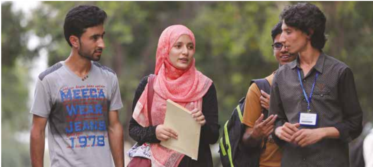
Incoming first-year NOP students are paired with senior NOP students as peer mentors

As LUMS graduates, these NOP scholars are equipped with vital skills and the confidence to thrive in a competitive job market. Utilising their world-class degree, they are quickly able to pursue lucrative careers. The economic impact on the families of these individuals is immeasurable.